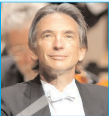
Renowned conductor and performer Michael Tilson Thomas (left) will be honored by the Folksbiene at a special performance in Avery Fisher Hall.